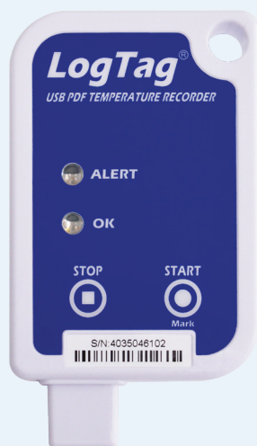
Rated Absolute Accuracy