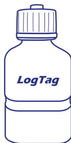
Glycol Buffer Not Included - Optional