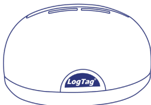
LTI-HID Interface Not Included - Optional